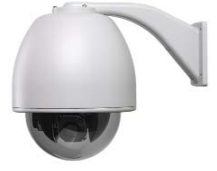
26x Day/Night dome camera with SilkTrack™ direct drive