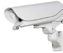
Flip-top open camera housing