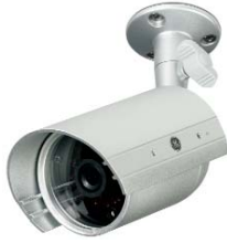
IP68 Day/Night color camera with built-in LED illuminators