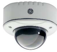
LEXAN® vandal proof mini-dome